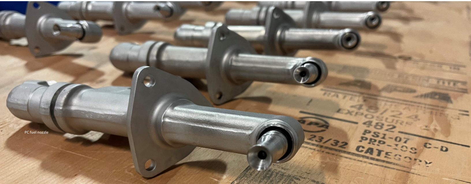
PC fuel nozzle