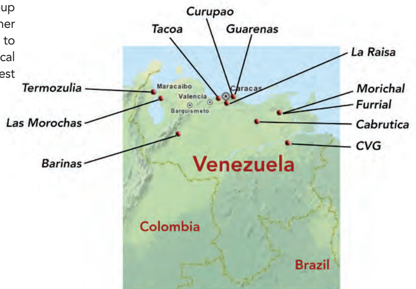
Current project sites in Venezuela